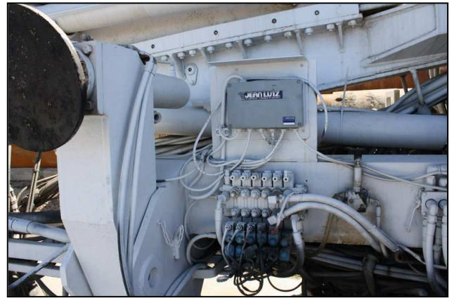
Système enregistreur Lutz