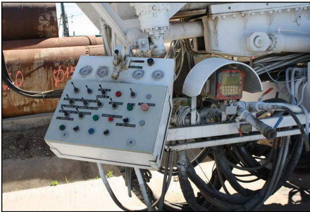
Panneau de commande