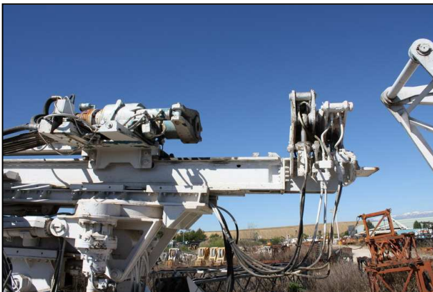
Tête de rotation 2 vitesses