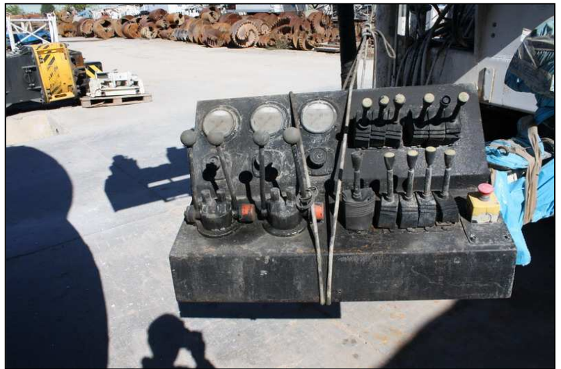
Panneau de Control