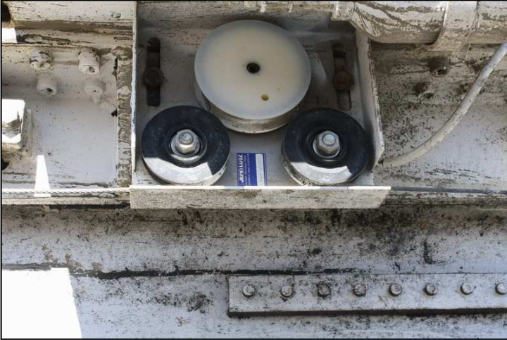
Système enregistrement paramètres Lutz