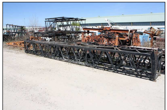
Eléments de Flèche